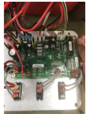
Remote Connection Spot (Pickle)