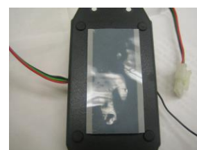
Velcro Adhesive (Back of Receiver)