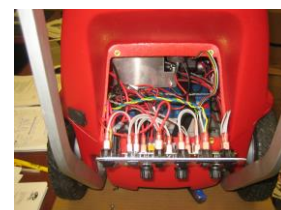
Control Panel – Open