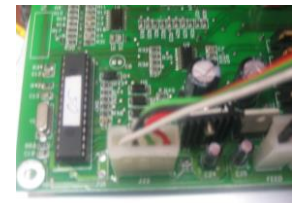
Remote Receiver Connected to Control Panel