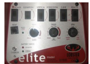
Control Panel - Closed