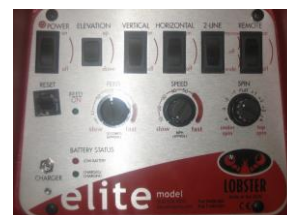
Control Panel – Closed