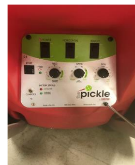
Control Panel- Closed (Pickle)